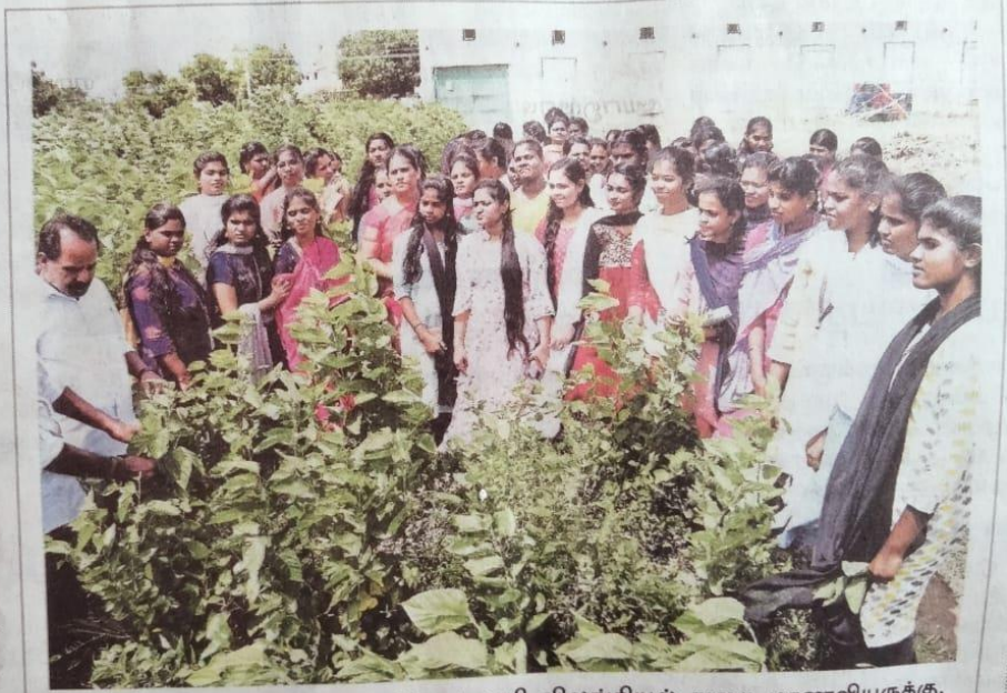
■ உடுமலை ஜி.வி.ஜி., மகளிர் கல்லூரி விலங்கியல் துறை மாணவியருக்கு, பட்டுபழு வளர்ப்பு குறித்து, விவசாயிகள் விளக்கம் அளித்தனர்.